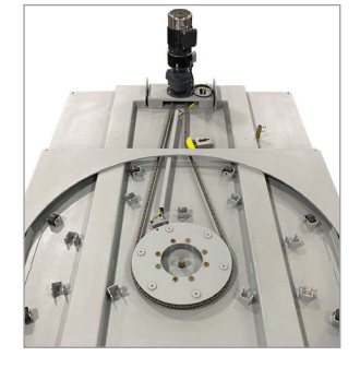
Robust Ring Bearing Support 6,000 lb. maximum load capacity,

The unique roller pattern provides over 180% of film-to-roller contact, ensuring consistent 260% film-saving prestretch, as well as fully utilizing film width for additional savings. Provides the most secure loads at the lowest possible cost.